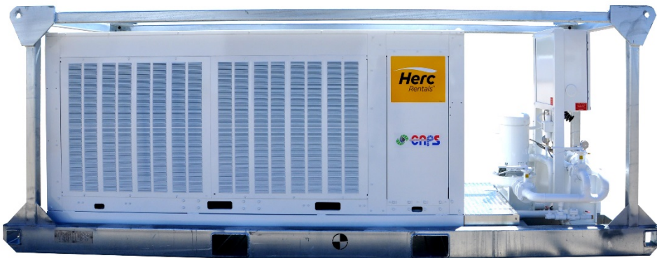
Lifting/Stacking Structural Skid & Cage