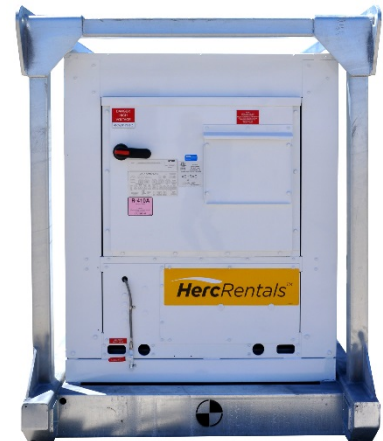
Chiller Control Panel End View

For more information contact: Herc Rentals www.hercrentals.com 1 (888) 658-1718