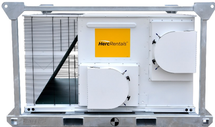
One (1) Supply & One (1) Return Air Connections