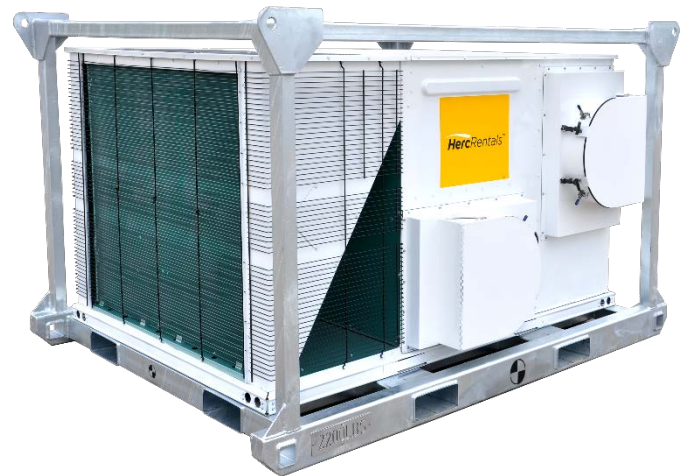
Corner View with Condenser Side and Air Connections

For more information contact: Herc Rentals www.hercrentals.com 1 (888) 658-1718